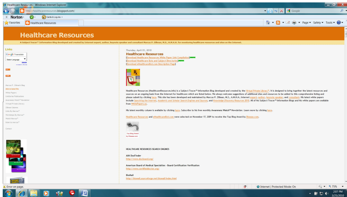
Figure 1: Healthcare Resources Subject Tracer™ Information Blog

These resources and sources will help you to discover the many pathways available to you through the Internet to find the latest healthcare sources and sites.